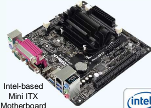
Intel-based Mini ITX Motherboard

Build and take home your very own super-fast, super-small, and super-cool Windows® computer!